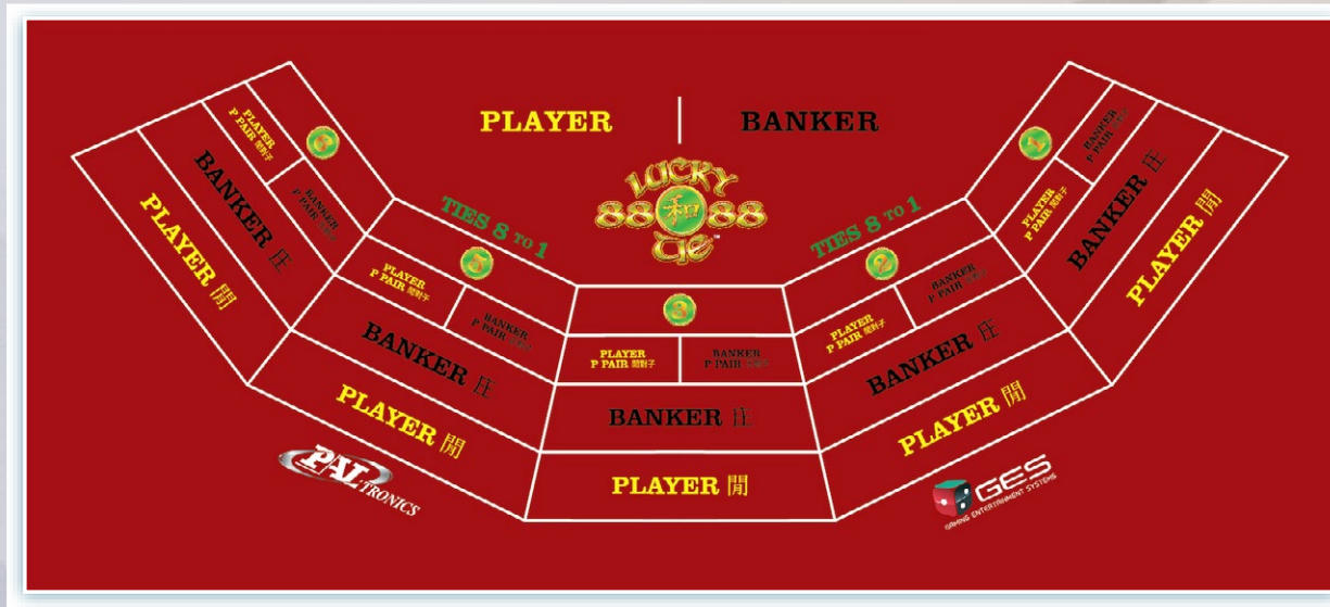
Lucky Tie Baccarat Layout Design

Lucky Tie is a house funded jackpot game where players have the chance of winning a progressive jackpot or a fixed prize when placing a normal tie bet. The Jackpot triggers when an 88 – 88 tie occurs. All players who placed a tie bet for that round share the Jackpot prize in proportion to the units bet. The incentive of a jackpot prize increases the amount of tie bets wagered and therefore increases the game win.