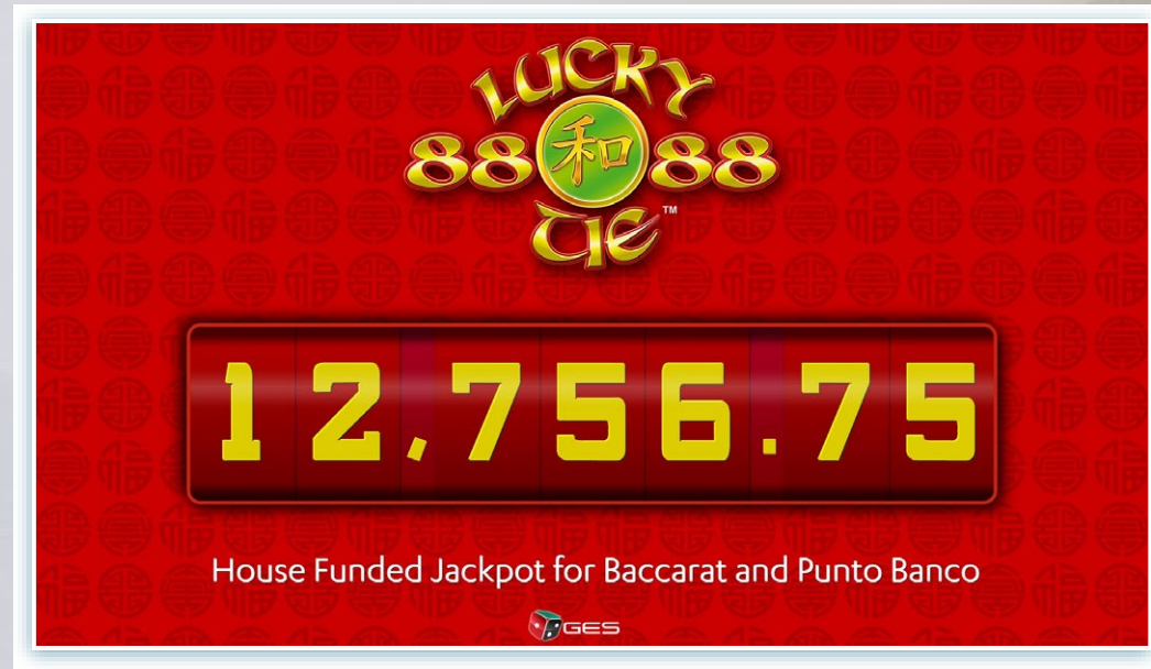
Lucky Tie Odometer Display