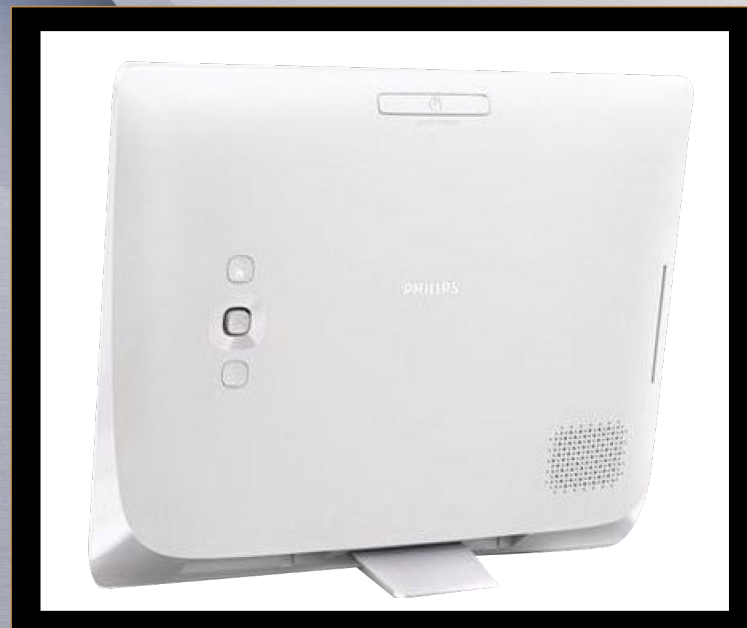
LCD MIN/MAX - TABLE SIGN