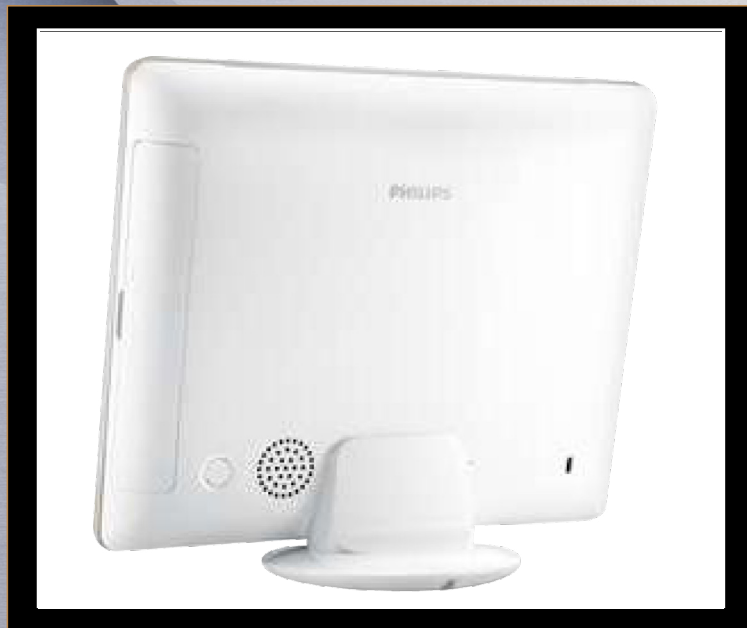
LCD MIN/MAX - TABLE SIGN