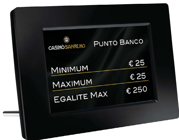
LCD MIN/MAX - TABLE SIGN