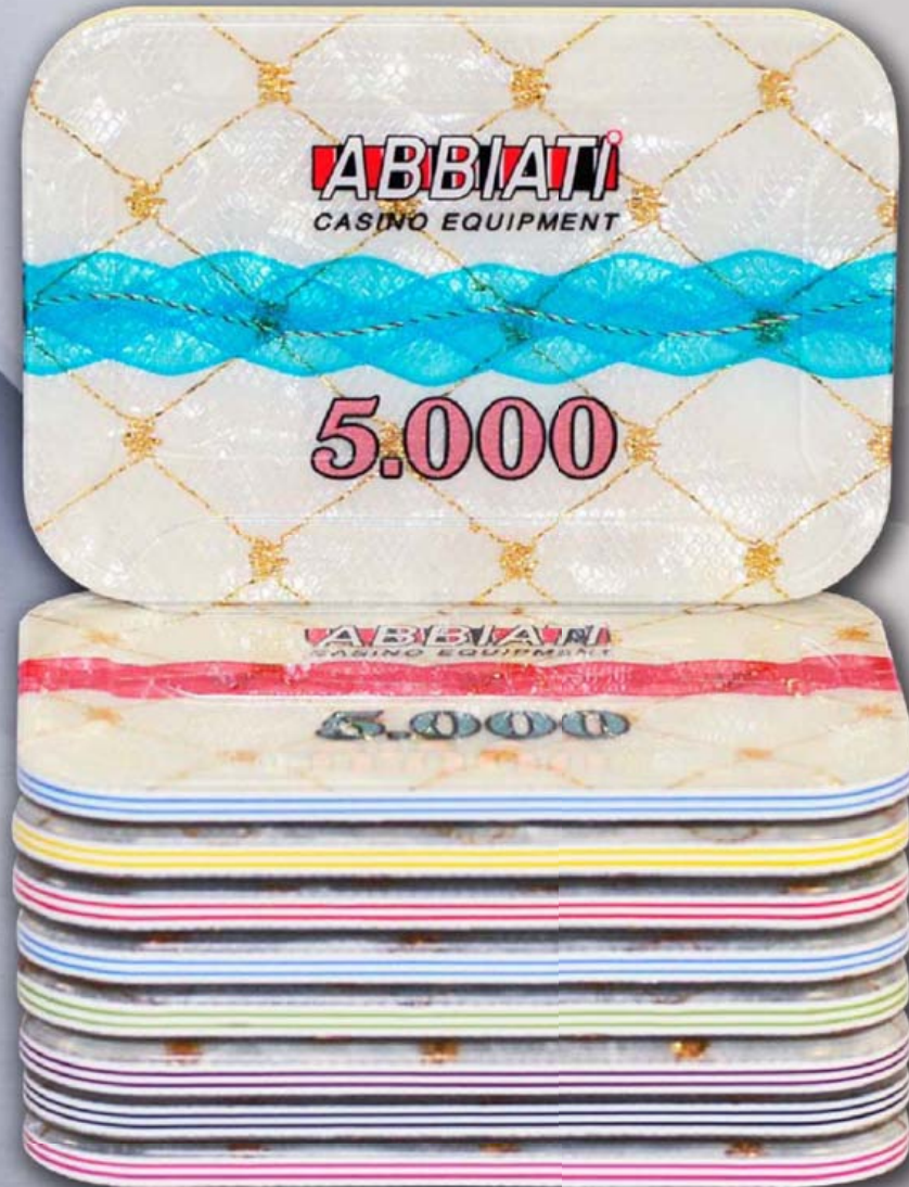
Coloured double liner