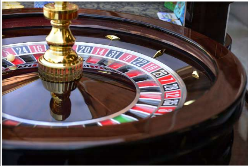
Dark Mahogany Wood