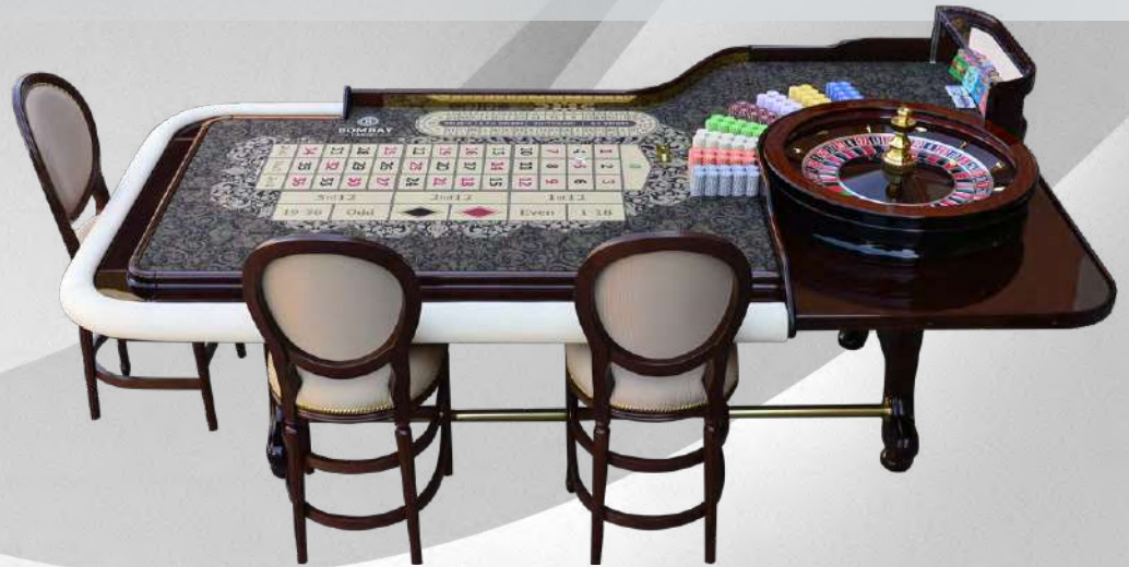
CUSTOMISED CONTEMPORARY DIFFERENT ESSENCES OF WOOD