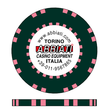
A=183 Bottle Green - B=34 Light Pink