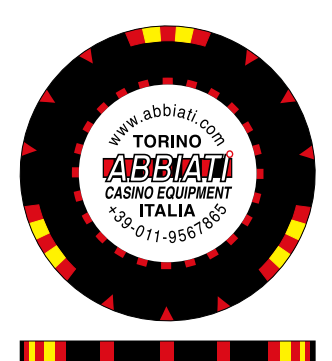
A=50 Black - B=05 Red C=25 Lemon Yellow