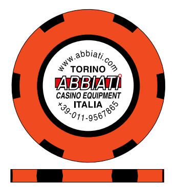
A=28 Fluo Orange - B=50 Black