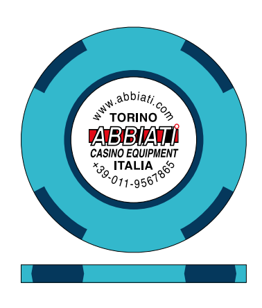
A=114 Sky Blue - B=40 Dark Blue