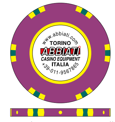
A=37 Violet - B=25 Lemon Yellow C=15 Turquoise