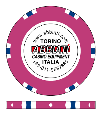
A=32 Fuchsia - B=10 White C=16 Royal Blue