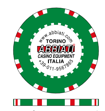
A=20 Leaf Green - B=10 White C=05 Red