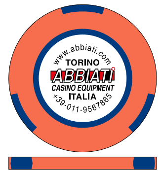
A=36 Light Orange - B=16 Royal Blue