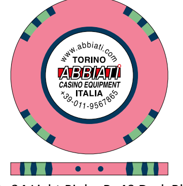
A=34 Light Pink - B=40 Dark Blue C=23 Sea Green