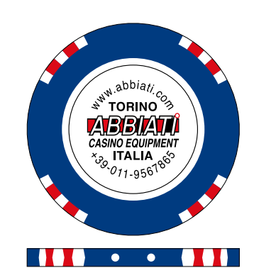
A=16 Royal Blue - B=10 White C=05 Red