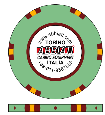
A=23 Sea Green - B=45 Brick Red C=24 Sun Yellow