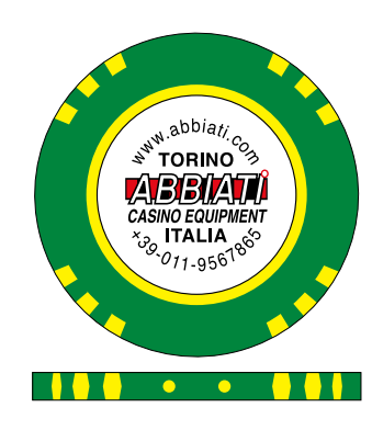
A=20 Leaf Green - B=25 Lemon Yellow