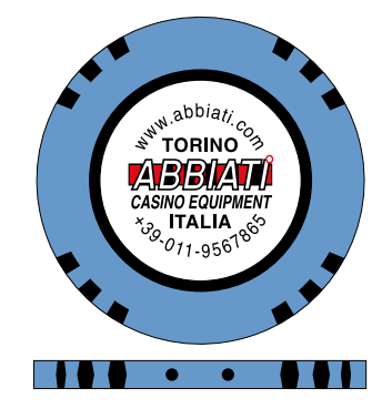
A=14 Light Blue - B=50 Black