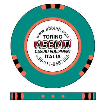
A=115 Light Turquoise - B=36 Light Orange C=50 Black