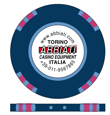
A=40 Dark Blue - B=14 Light Blue C=32 Fuchsia