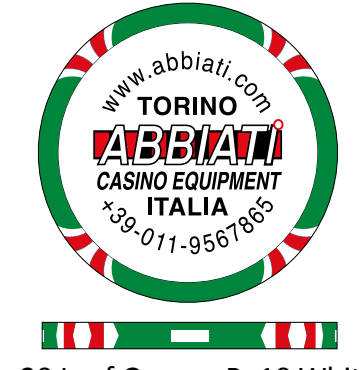
A=20 Leaf Green - B=10 White C=05 Red