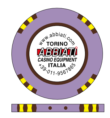
A=39 Lilac - B=44 Dark Brown C=25 Lemon Yellow