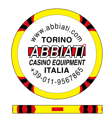
A=25 Lemon Yellow - B=05 Red C=50 Black