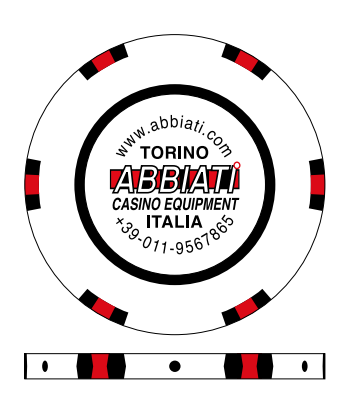
A=10 White - B=50 Black C=05 Red