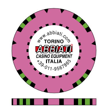
A=137 Light Violet - B=50 Black C=19 Green