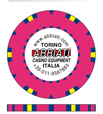
A=35 Fluo Pink - B=16 Royal Blue C=25 Lemon Yellow