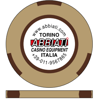
A=42 Dark Cream - B=44 Dark Brown