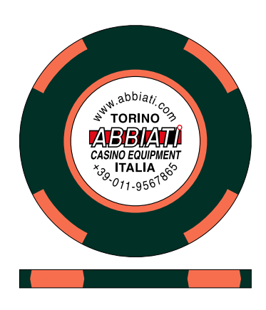
A=183 Bottle Green - B=36 Light Orange