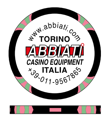
A=50 Black - B=34 Light Pink C=23 Sea Green