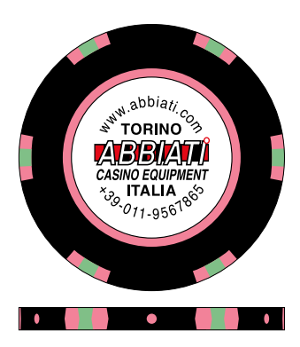
A=50 Black - B=34 Light Pink C=23 Sea Green