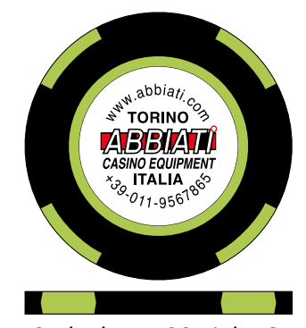
A=50 Black - B=22 Light Green