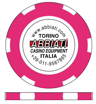
A=35 Fluo Pink - B=10 White