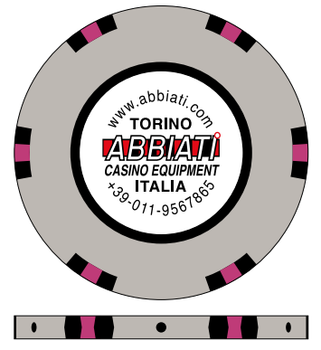
A=48 Light Grey - B=50 Black C=32 Fuchsia