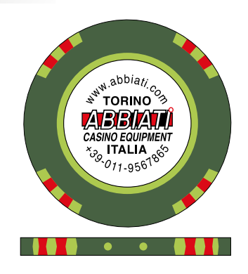
A=09 Olive Green - B=22 Light Green C=05 Red