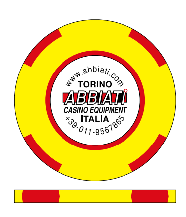
A=25 Lemon Yellow - B=05 Red