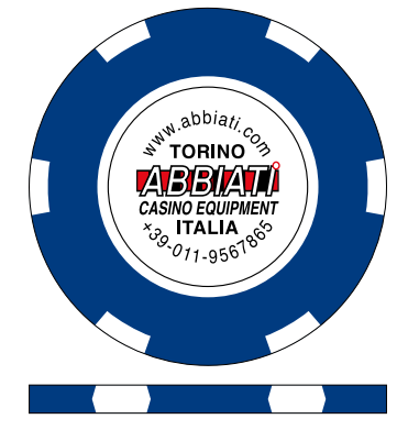
A=16 Royal Blue - B=10 White