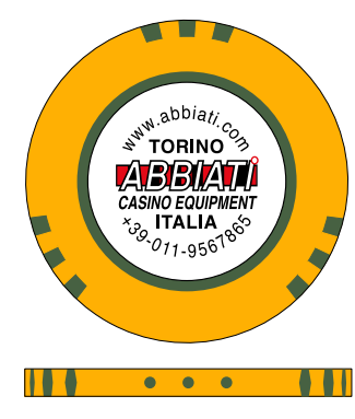
A=24 Sun Yellow - B=09 Olive Green