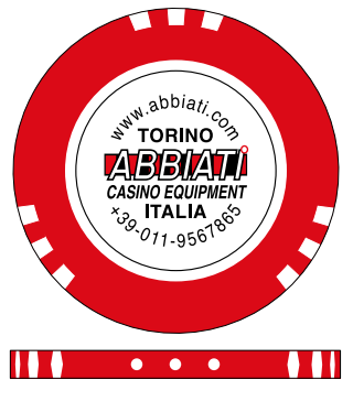
A=05 Red - B=10 White